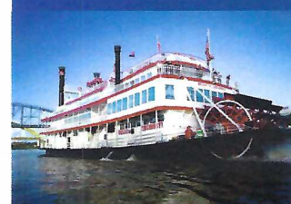
Enjoy a BB Riverboats Sightseeing Cruise